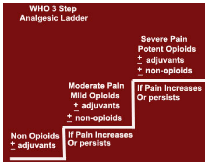
Figure 3. WHO Three-Step Analgesic Ladder

The World Health Organization (WHO) established a three-step analgesic ladder to guide the selection of interventions to treat pain (see Figure 3 and Table 1). Nonpharmacologic interventions are incorporated with medications throughout the ladder (APS, 2003).